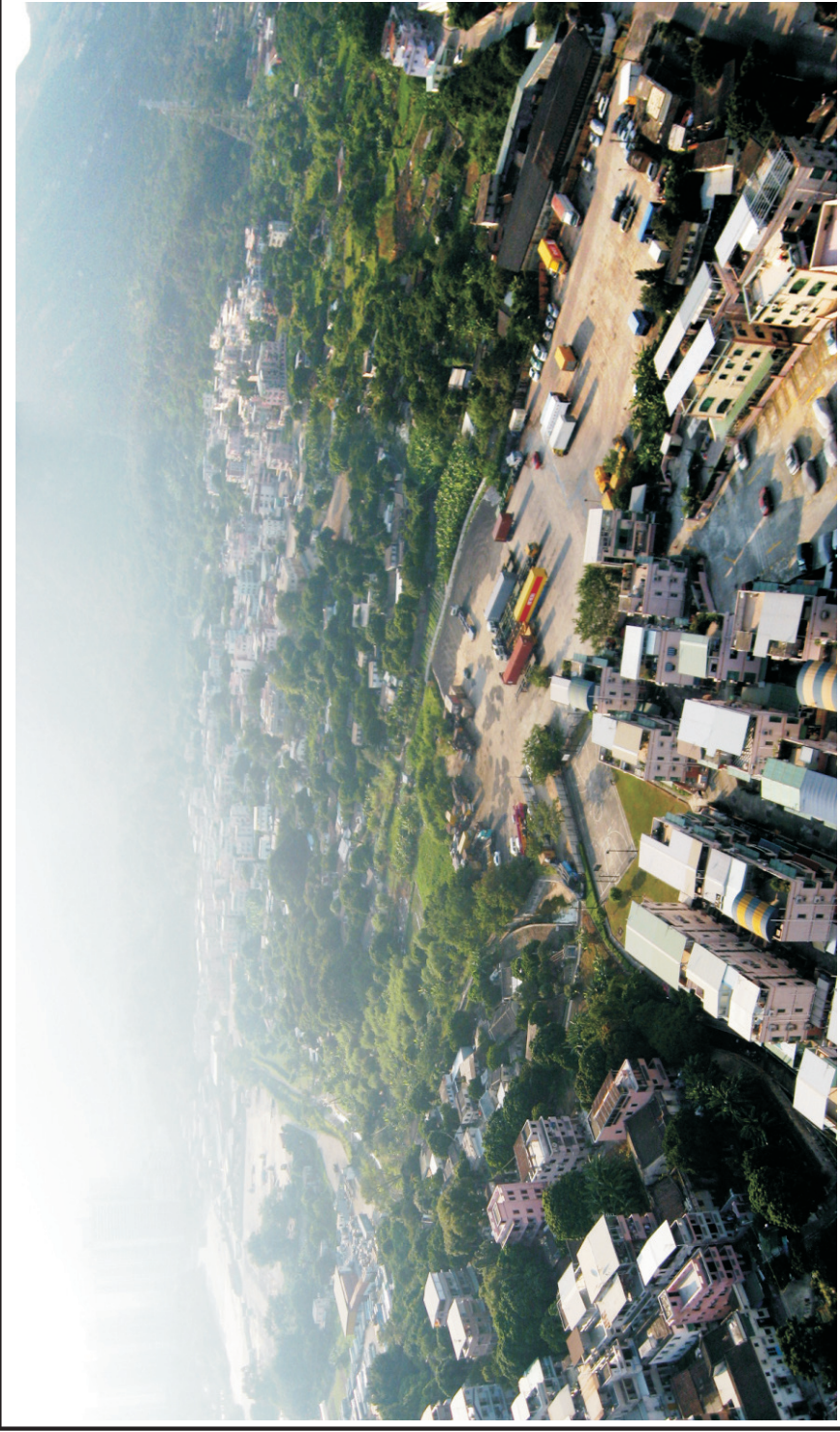
Day 1 with Mitigation Measures